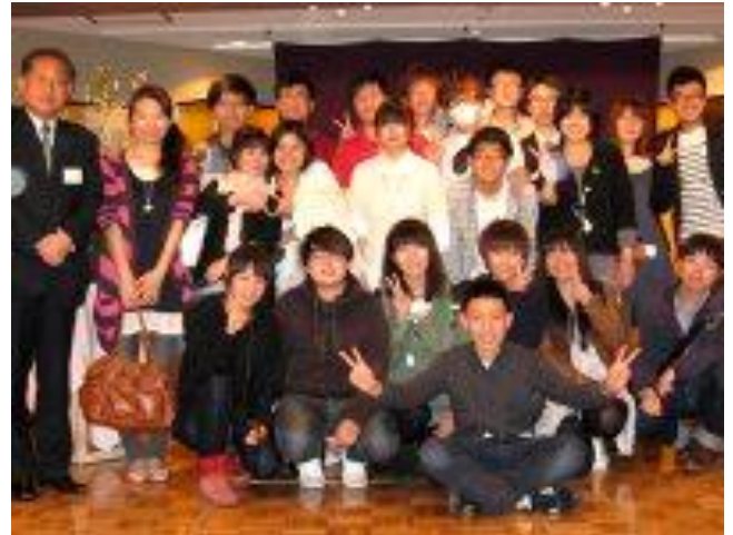
More than 300 attendees spent a pleasant time in a friendly atmosphere.