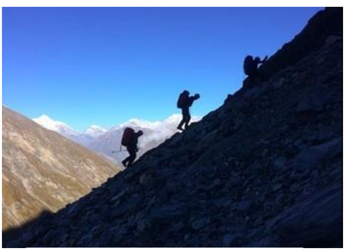
Finding the route to Lama Peak

during the Meiji Era in search of the original scriptures of Buddhism, had taken when crossing the Himalayas. When they reached the summit of Kubi Kangri (6,721m) successfully for the first time in 2007, the club