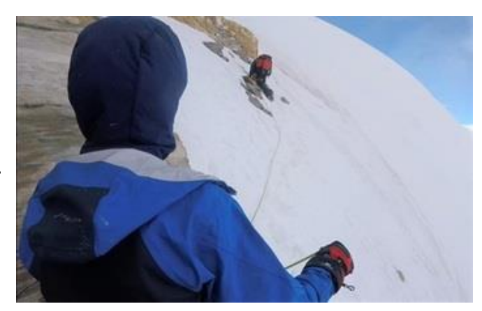
Climbing a steep route

conducted academic research on the retreat of glaciers affected by global warming. When they conquered the unclimbed peaks of Changla (6,563 m) and Aichyn (6,055 m) in western Nepal for the first time in history in 2010 and 2015, respectively, the club also conducted research on the respective mountain areas. Of particular note was the club's expedition to Nepal in 2015 for research on damage caused by a large earthquake that had struck the country. In Khumjung, a village close to the epicenter, the club inspected