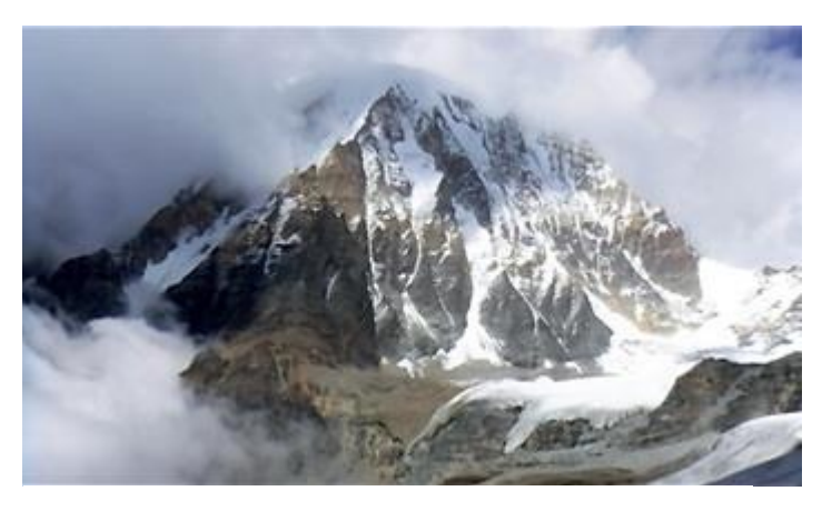
Lama Peak (6,527 m)