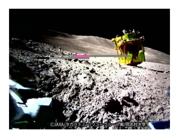
Lunar Surface image taken by LEV-2 (SORA-Q)

Ultra-Compact Lunar Exploration Vehicle, LEV-2 (SORA-Q), wins award at the 11th Robot Awards (Minister of Education, Culture, Sports, Science and Technology Award) and the Robots and Society Award from the Robotics Society of Japan!